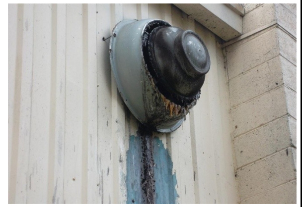
Terminating Exhaust Fan with Issues – No cleaning in two years