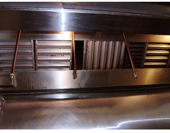
Filters Installed Incorrectly