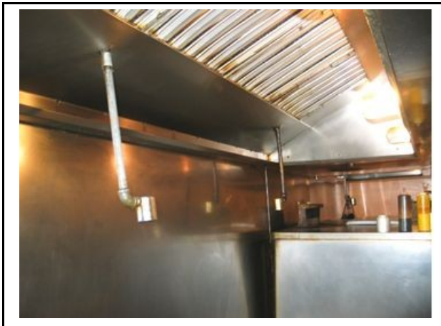
Dry System Nozzle

In the past, a dry chemical extinguishing system was allowed. It is easy to distinguish dry systems from wet systems due to the extinguishing nozzles. The dry systems have nozzles that are larger than wet system nozzles.