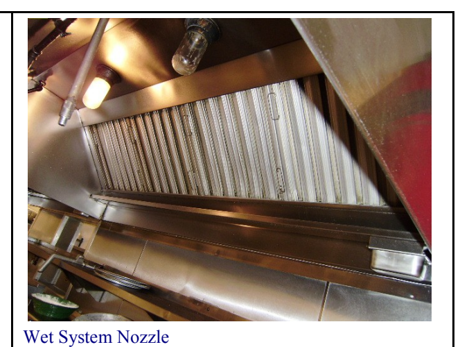
There are wet systems that are not UL300 compliant. More inspection is required to determine if the wet chemical is UL300 compliant. The label on the cylinder containing the chemical should disclose whether the chemical is UL300 compliant. Some companies have changed the look of the labels on their cylinders to more easily distinguish between wet non UL300 compliant and a wet UL300 compliant. For example, Pyro-Chem has changed their labels from being silver with black lettering to silver to blue lettering. The blue lettering is UL300 compliant while the black lettering is no UL300 compliant. However, it is best to always look for the UL300 disclosure on the label.