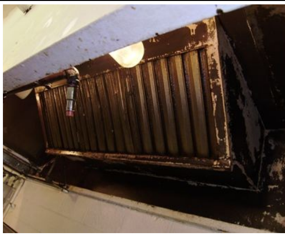
Excessive Grease Buildup