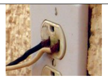
There was a problem with the plug