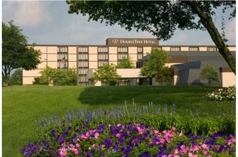
DoubleTree Hotel. Worthington, Ohio

We are sure you will find this year's program informative, educational, and worthwhile, as well as an opportunity to network with fellow members of the insurance loss control profession.