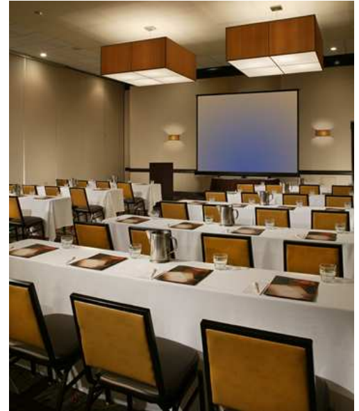
DoubleTree meeting facilities

Just a heads up. When registering for the conference in October, please make reservations at our conference hotel if possible. They have offered us a very competitive room rate, $99.00, and we have committed to them for a specific number of room-nights. (Their normal room rates begin at $129). If we meet our quota, the association saves on conference room costs and other fees. When you reserve your rooms at the hotel, be sure and mention that you are with the ILCA conference so that you obtain the special room rate. You may call: 614-885-3334 or 1-800-870-0349. Thanks for your support. The Doubletree is a great hotel! You will enjoy!