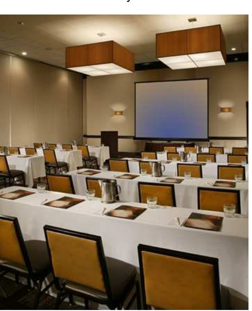
DoubleTree meeting facilities

Located north of the city, the Doubletree Hotel Columbus/Worthington offers an upscale design in a popular suburban setting. Conveniently located within the Crosswoods development right off St. Rte 23 and the I-270 outer belt, the hotel is surrounded by more than 25 fine restaurants and a movie theatre complex. Just minutes away from Worthington Industries, JP Morgan Chase, PPG Industries, and the new Polaris Fashion Place Mall. Enjoy championship golf tournaments 10 minutes away from our hotel at the Muirfield Village Golf Club or plan a fun day at the Columbus Zoo. ed on the banks of the Scioto River in Buckeye Country, Columbus is one of the fastest growing economies in the US, driven by high-tech companies such as CompuServe. The capital of Newly Renovated 17,000 sq. ft. of Meeting Space.