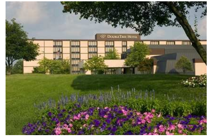
DoubleTree Hotel. Worthington, Ohio

This year we want to continue something that began a couple of years ago; inviting our underwriters. We have had several underwriters attend the conference over the past few years with very positive feedback. This gives them the opportunity to learn a bit more about the technical side of some of the operations that they insure. A bit of technical background will assist them in understanding reports from their loss control counterparts. Pass the word; invite the underwriters at your company.